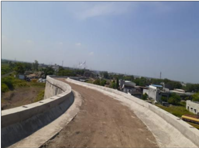
Coping beam installation completed