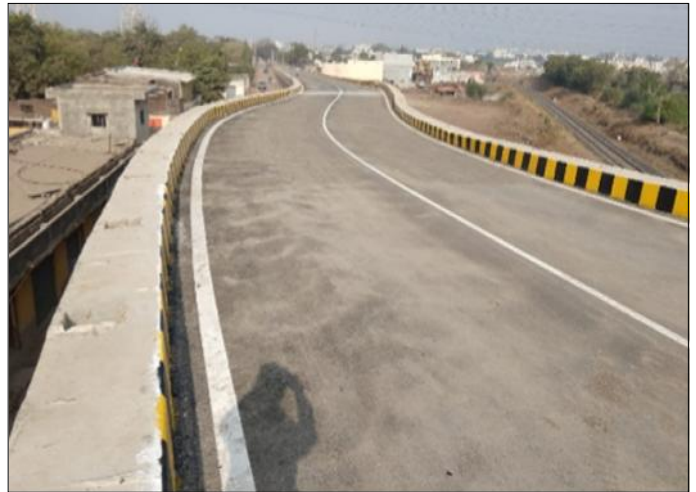
Completed longitudinal road profile