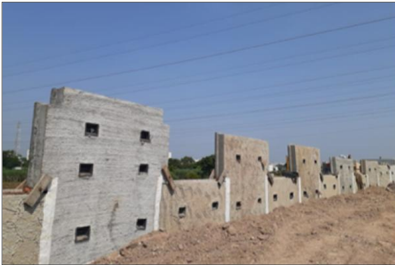
Erection of RCC Facia Panel in Progress