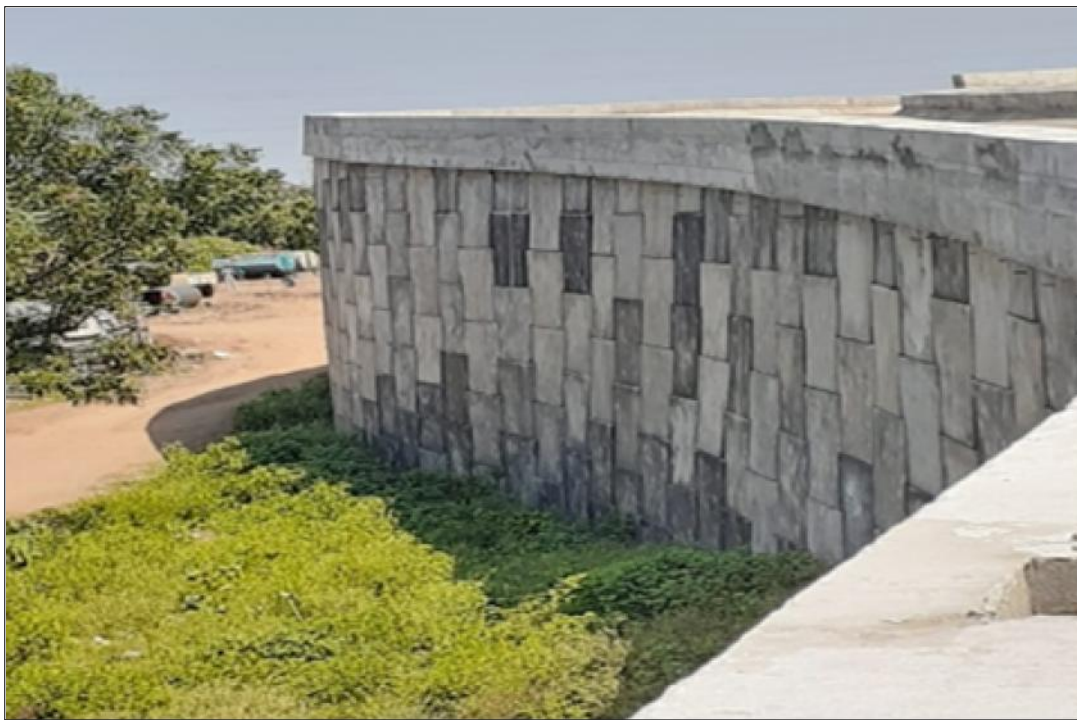
Completed Reinforced Soil Wall with Panel Facia and TechStrap Reinforcement