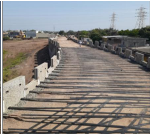
Installation of top layer TechStrap Polymeric Strip