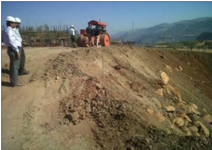
RSW with Weld Mesh - Under Construction