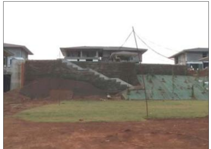
RSW with Weld Mesh - Staircase Completed