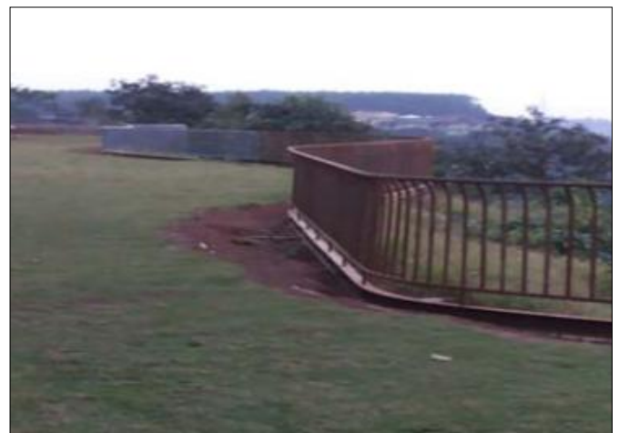
Techfab Metal Gabion Wall - Completed