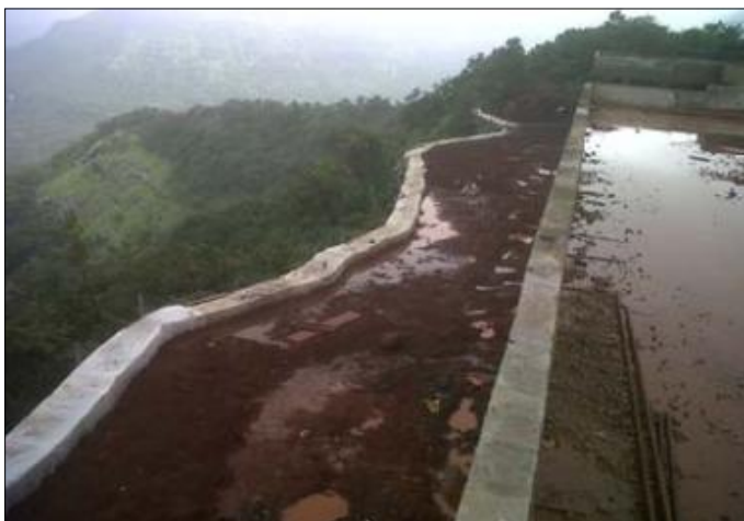
Techfab Metal Gabion Wall – Top View