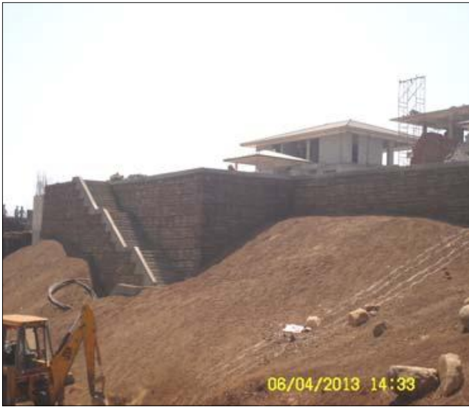
RSW with Weld Mesh - Entrance