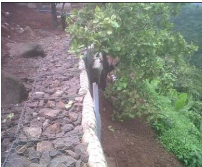
Techfab Metal Gabion Wall - Valley Portion