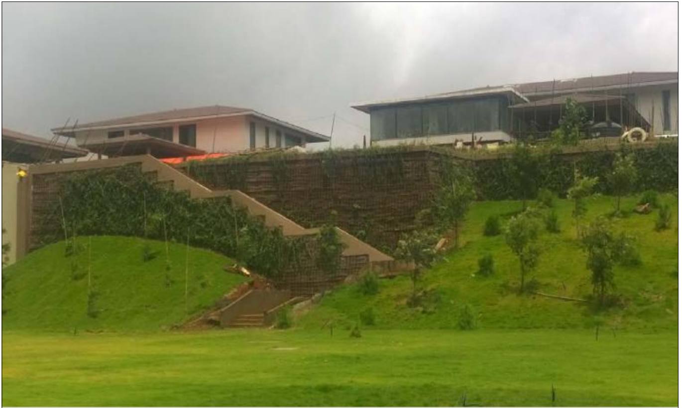
After Completion of Project with full vegetation