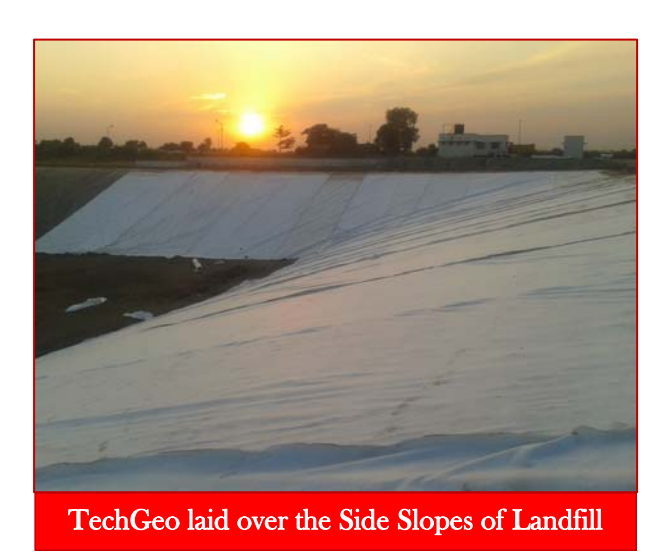
TechGeo laid over the Side Slopes of Landfill

Manufacturer: Tech Fab (India) Industries Ltd.