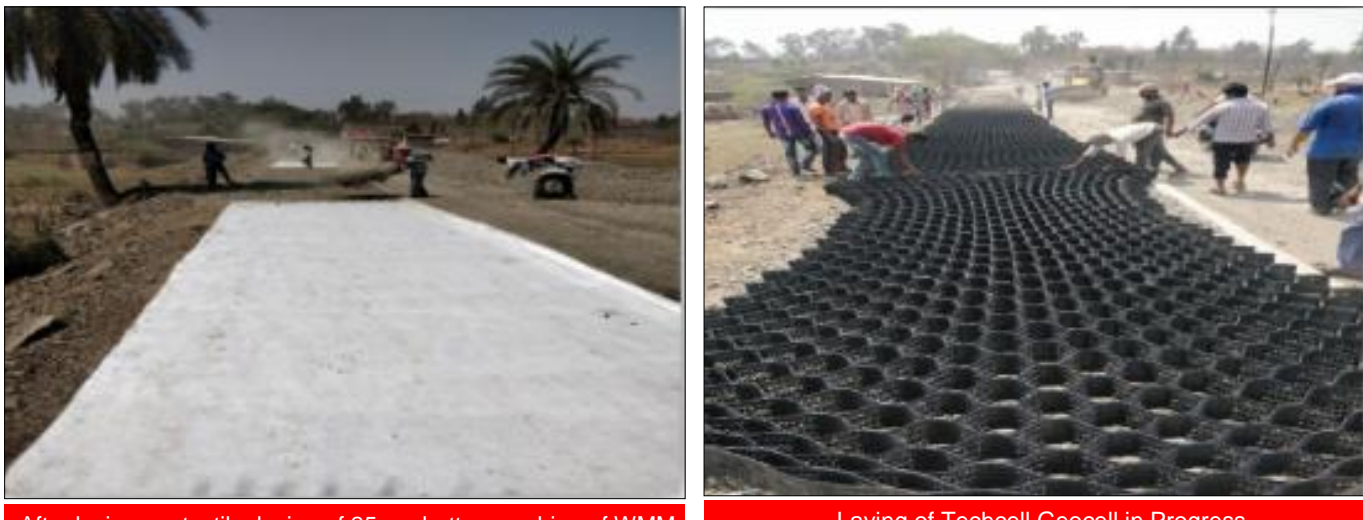
After laying geotextile, laying of 25mm bottom cushion of WMM

The use of Techcell Geocell not only increase the strength and bearing capacity but also enables a reduction in the layer thickness of base and sub grade layers resulting in cost saving which results saving in project and life cycle costs. The perforation (holes) in Techcell walls enhances the drainage and releases pore water pressure from pavement section.