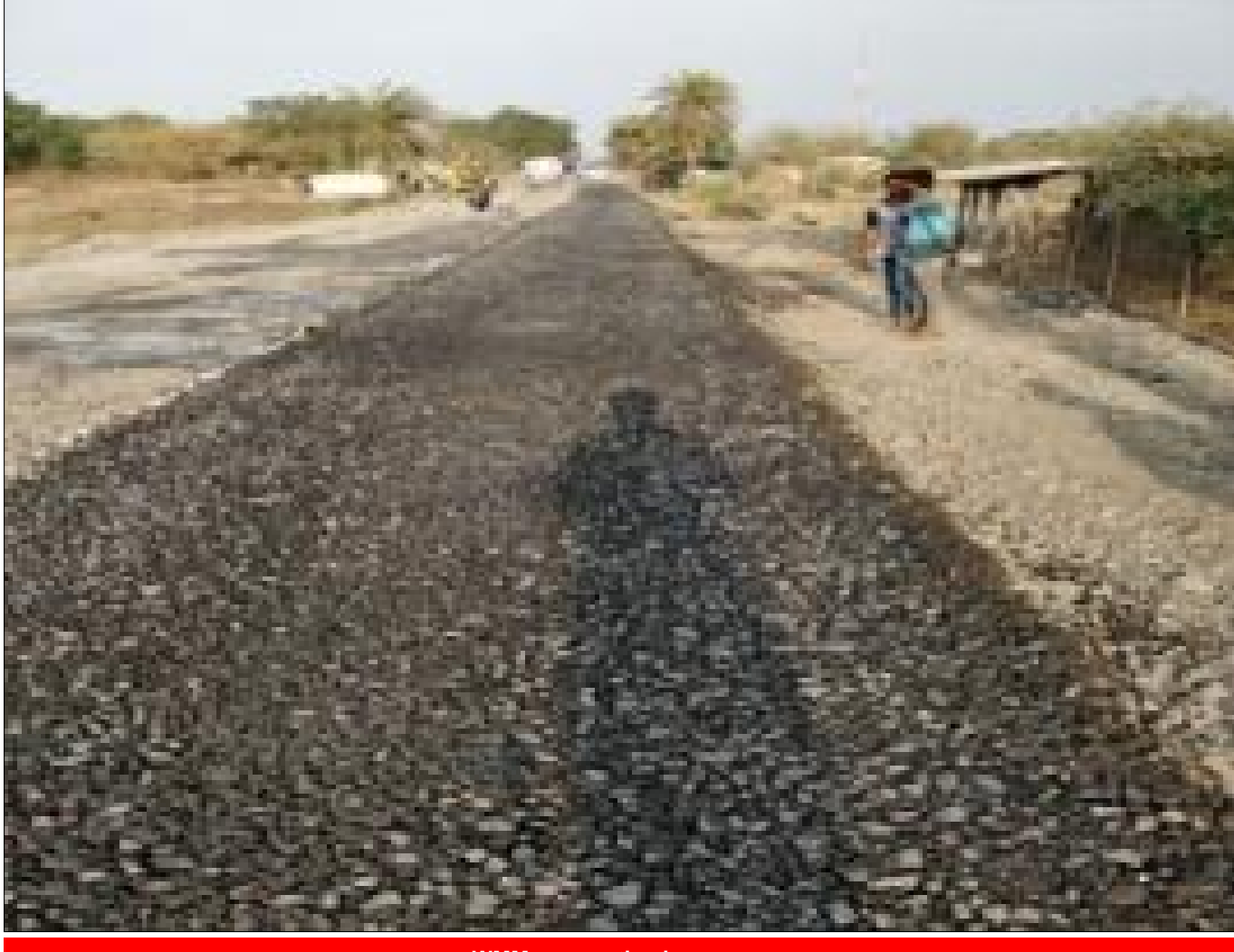
WMM compaction in progress