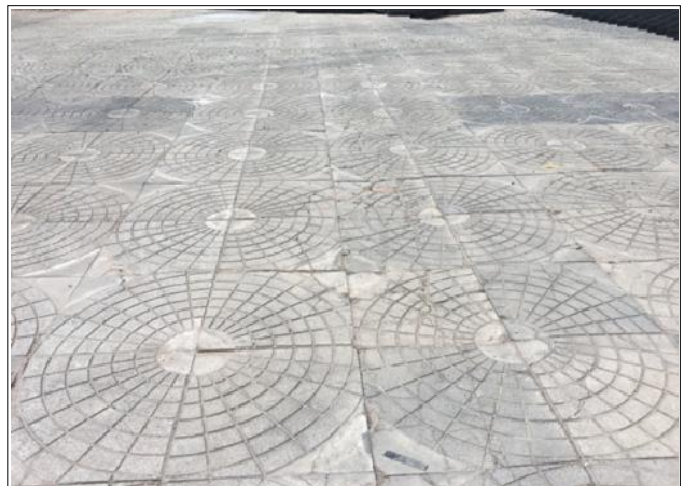
Old damaged parking area