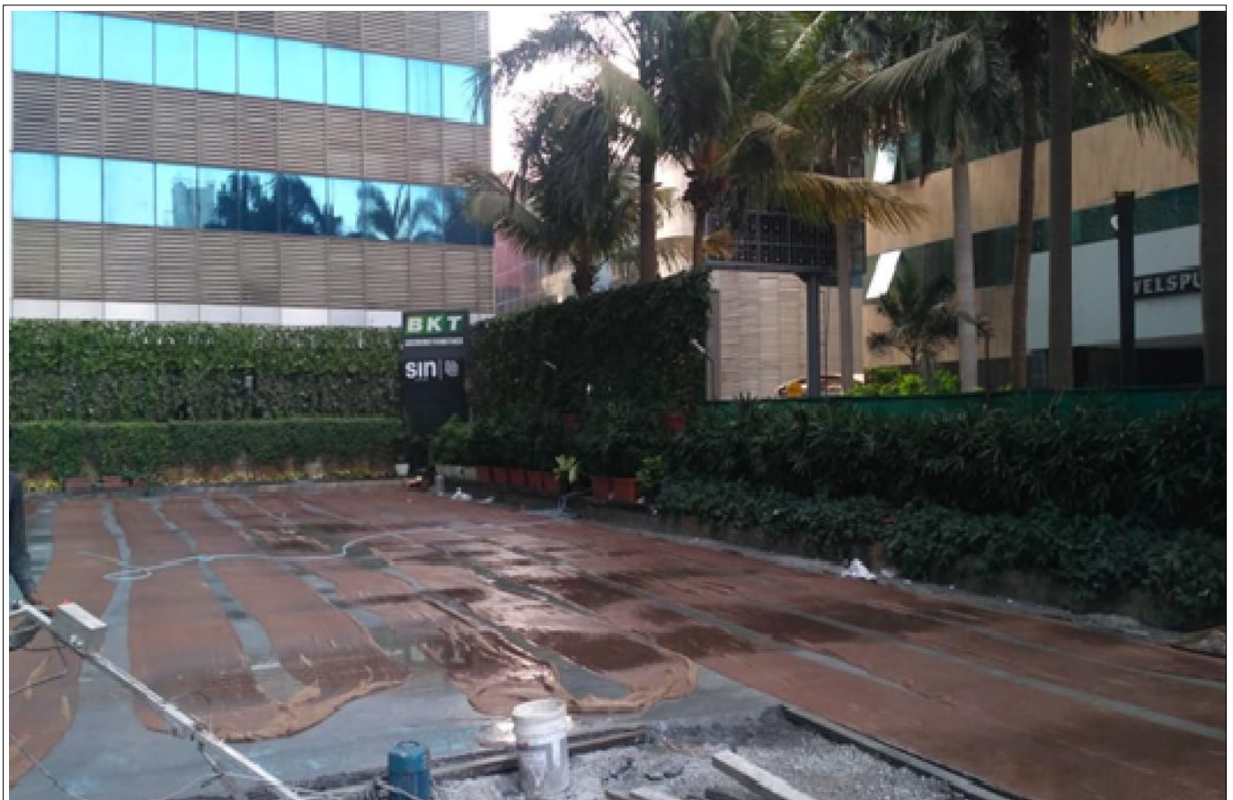
Concrete flooring above Techcell Geocell

Techcell Geocell was in filled with crushed stone aggregate and compacted with plate then 100 mm thick PCC was done in stages. While constructing levels are checked at multiple points, proper drainage arrangements were done by giving proper slope so that there won't be water logging issue in future.