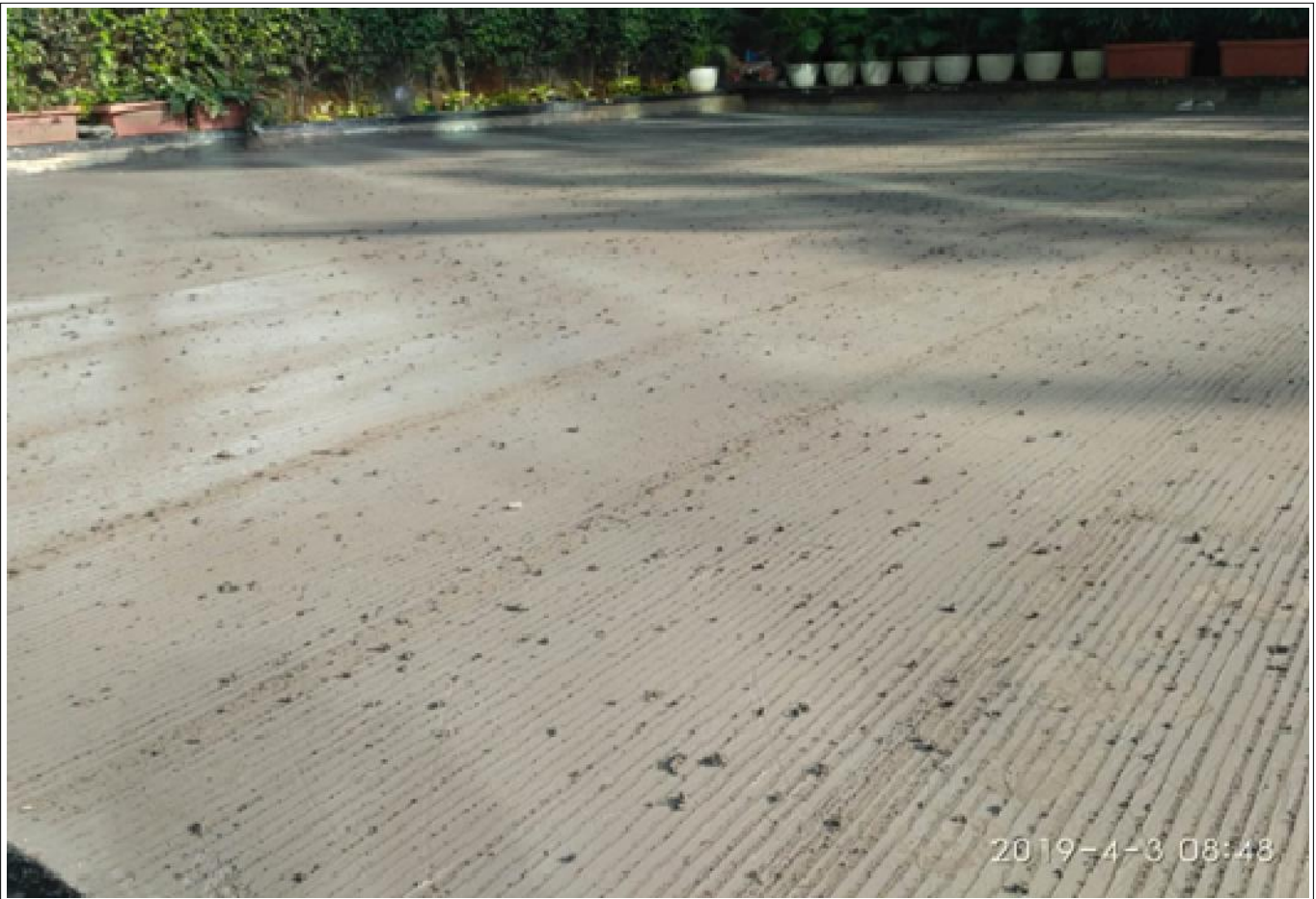
Finished parking area in less than week time