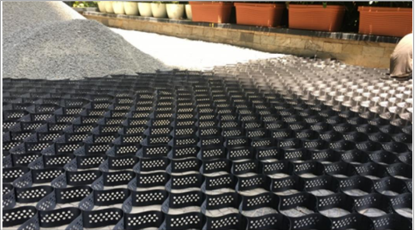
Expanded Techcell Geocell

The 3D confinement of Geocell prevents movement and shearing of soil infill under cyclic loading, while reducing aggregate attrition. The confinement system also maintains soil compaction, thereby providing long term soil reinforcement and structural strength as well as improves moduli of infill materials, while increasing the bearing capacity of the structural pavement layers of load support.