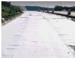
Subsurface Drainage of Highways